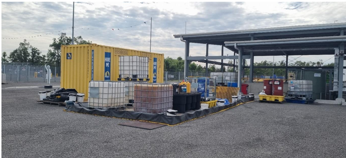
Photograph 3 – temporary bunding for construction storage