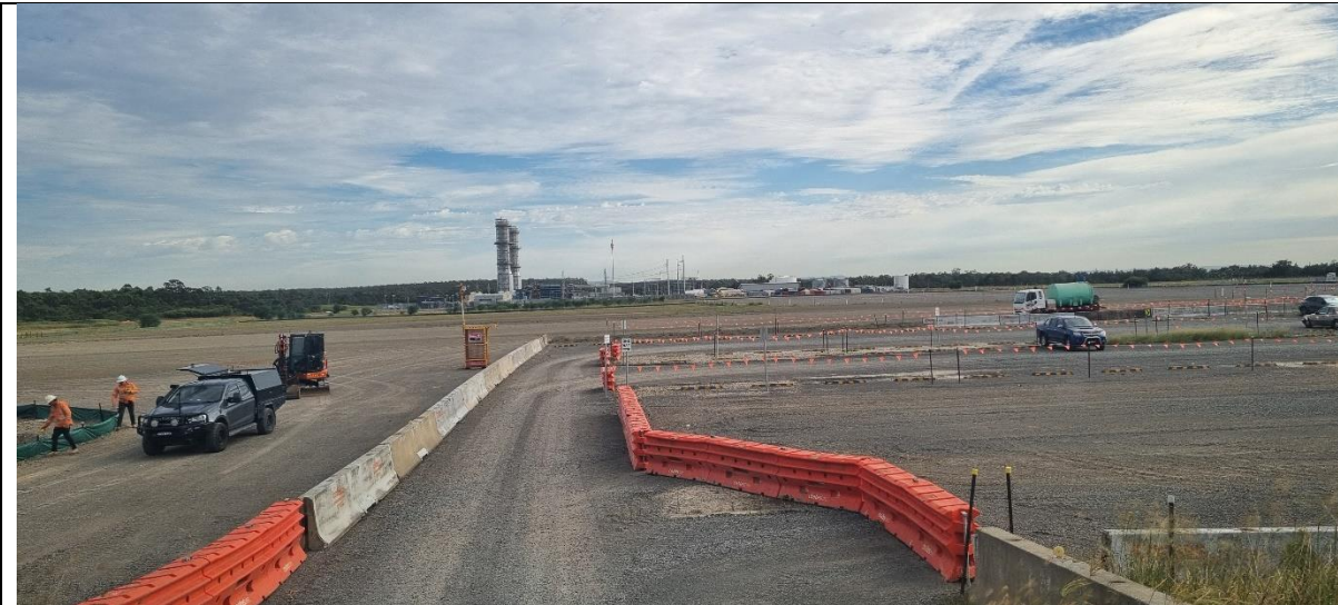
Photograph 1 – current staff car park and the former Precinct 3B in the mid-ground.