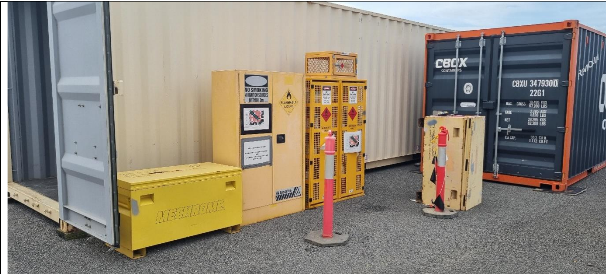
Photograph 4 – dangerous goods storage