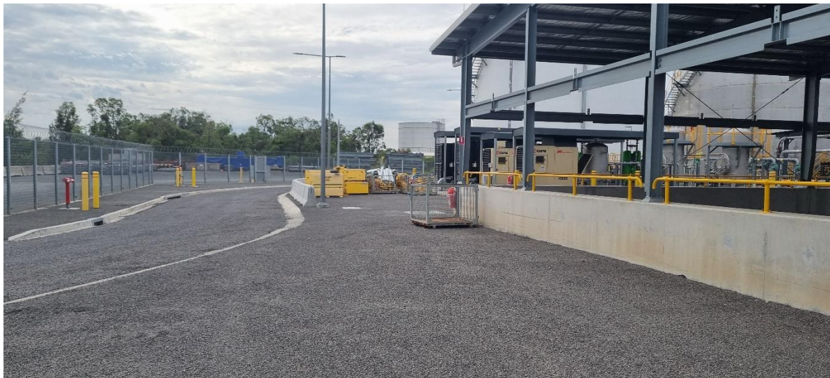
Photograph 2 – typical road and sealed works areas.