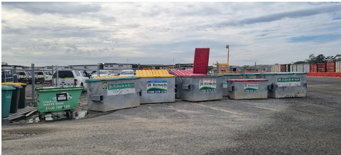
Photograph 6 – Waste Storage and segregation