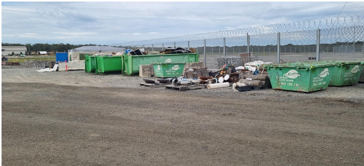
Photograph 5 – Waste and recycling storage area