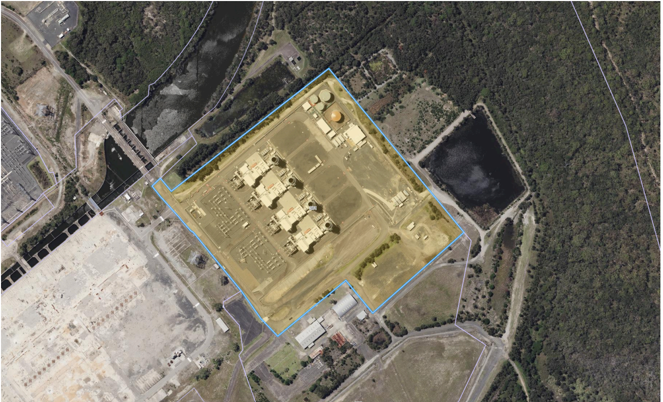
Figure 3.1: Colongra Power Station premises boundary (Lot 122 DP 1290829) as specified in the Project Approval (05_0195 Mod 6).