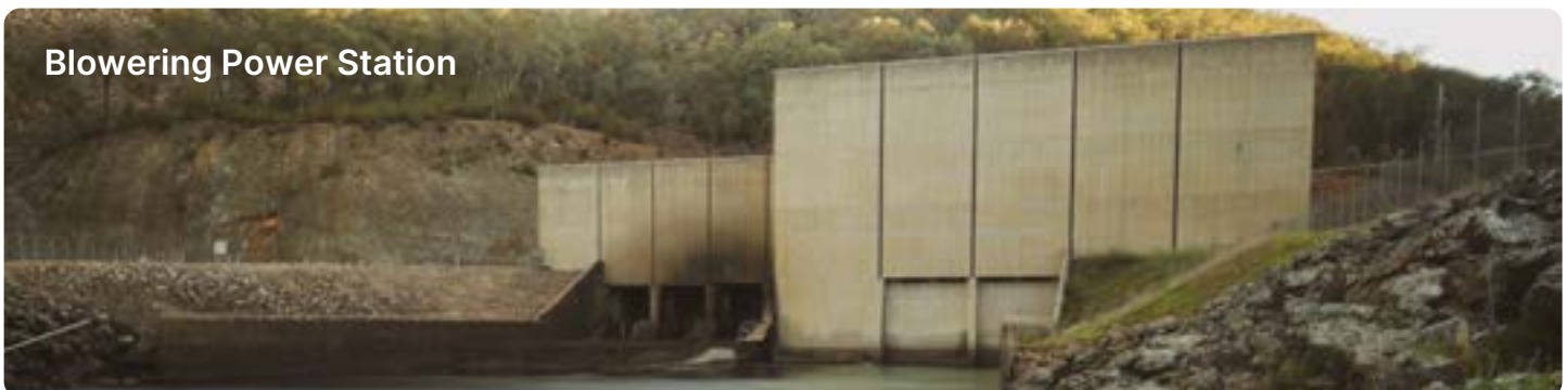
Blowering Power Station

Water releases from Blowering Dam are controlled by the NSW State Government to provide for downstream town water supply, irrigation and environmental uses.