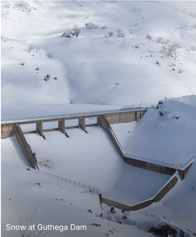
Snow at Guthega Dam