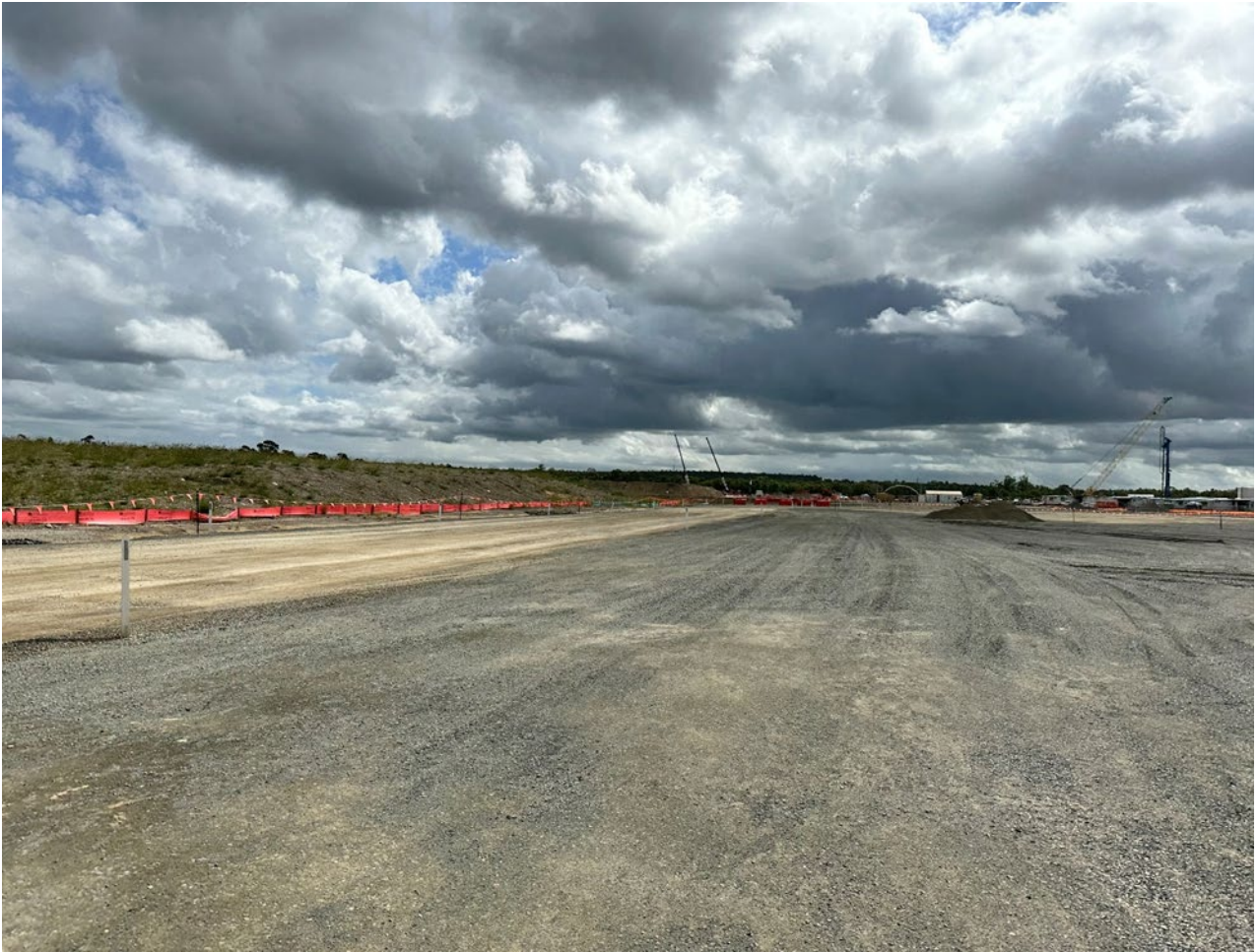
Photograph 3 – Internal access road (stabilised) and perimeter boundary