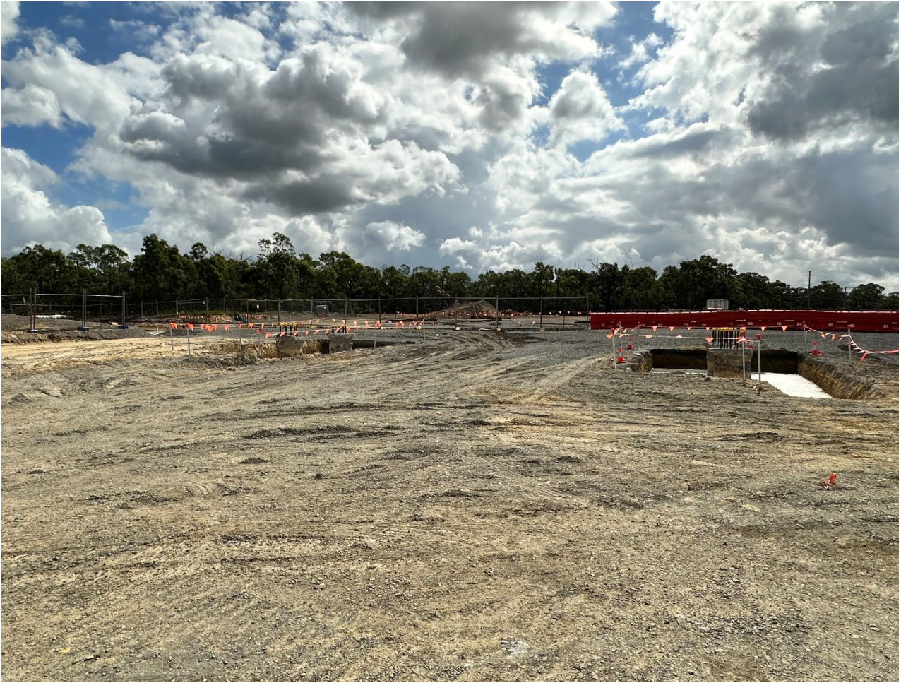
Photograph 2 – Completed piles and foundations