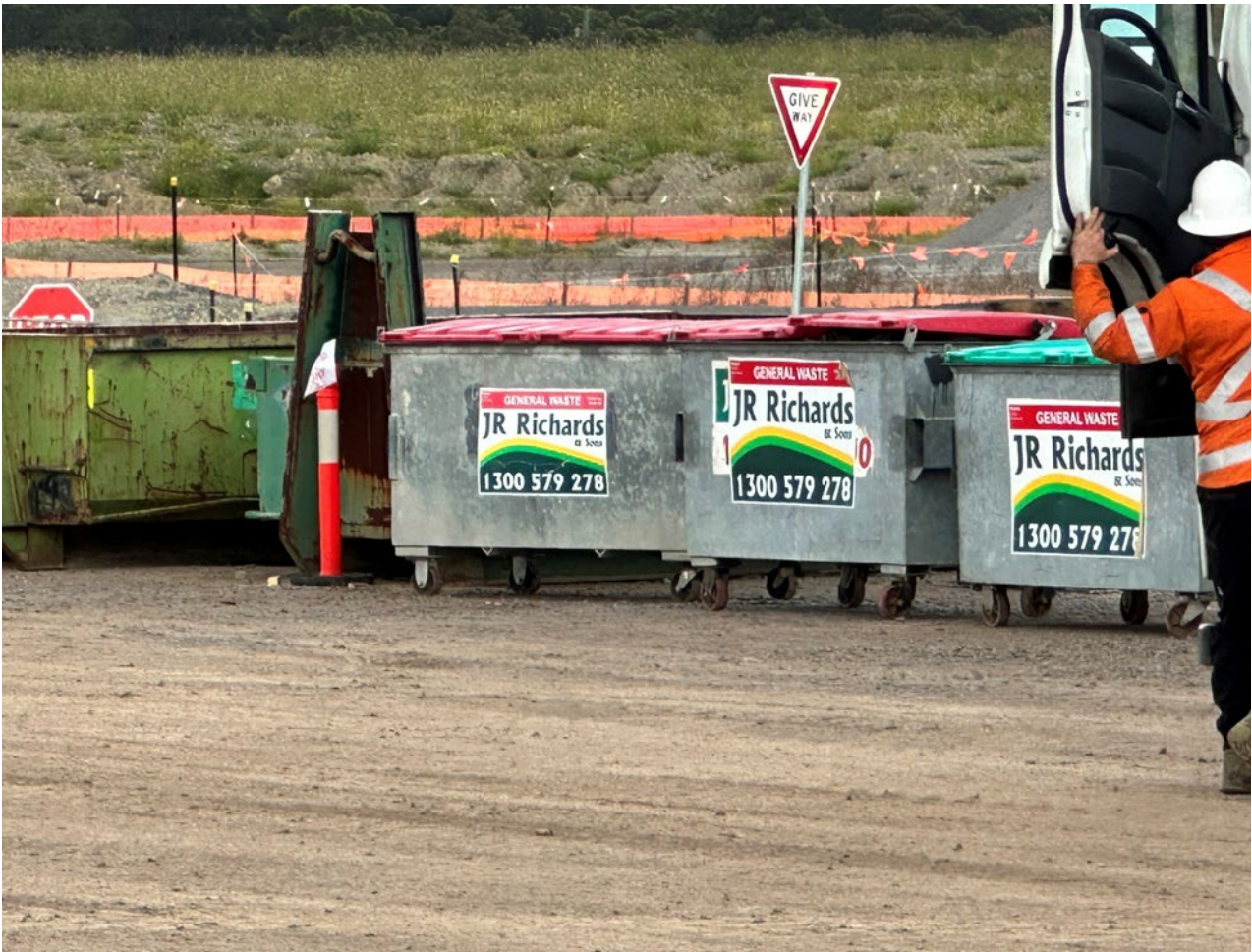
Photograph 9 – Waste storage containers