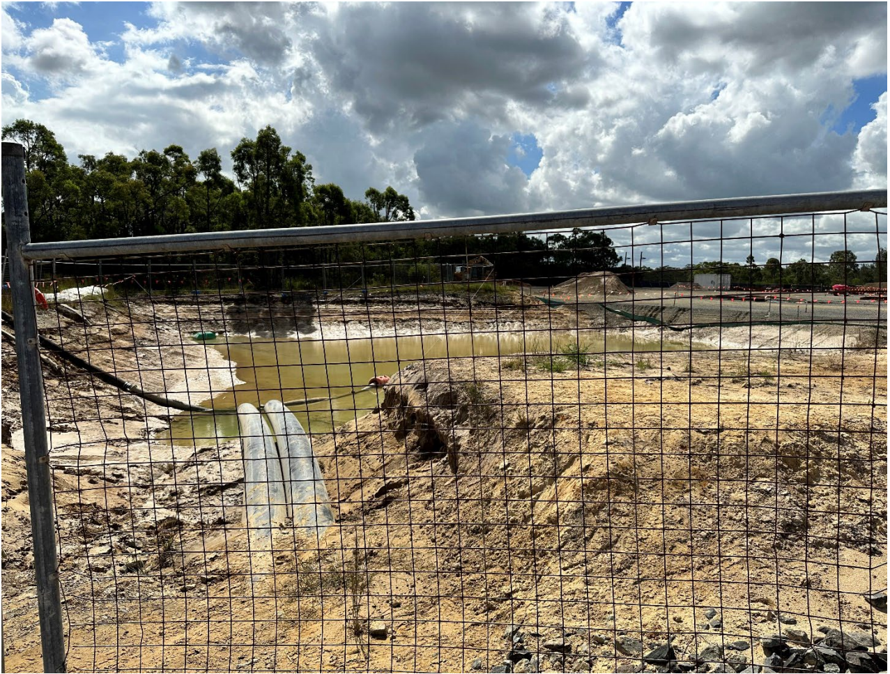
Photograph 6 – Construction sediment basin