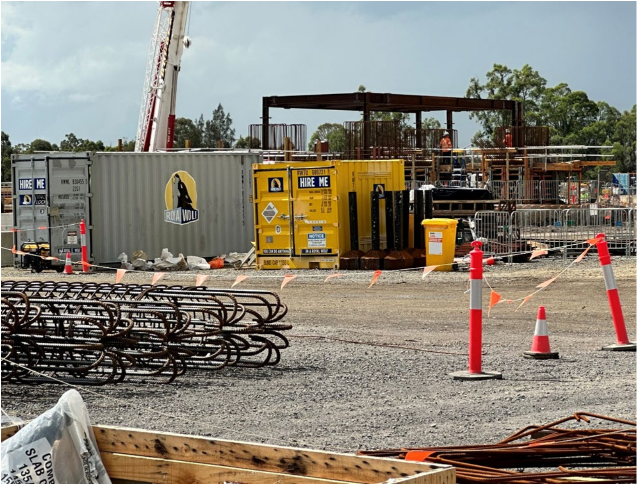
Photograph 8 – Bunded and ventilated chemical storage container and spill kit