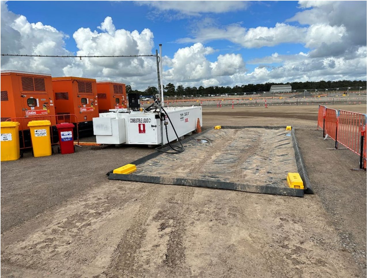
Photograph 7 – Bunded refueling point and spill kits