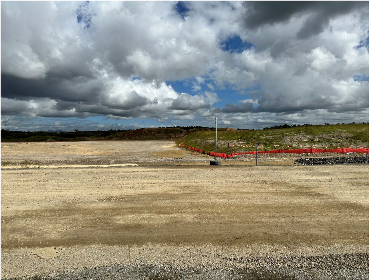
Photograph 4 – Perimeter drainage and vegetated earth embankment