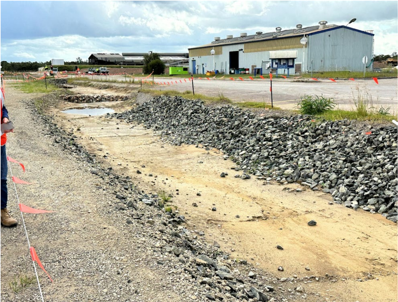
Photograph 5 – Perimeter drainage with rock checks and scour protection