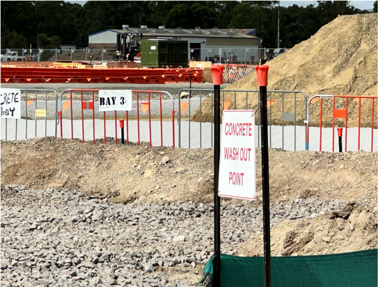
Photograph 10 – Concrete Washout Pit