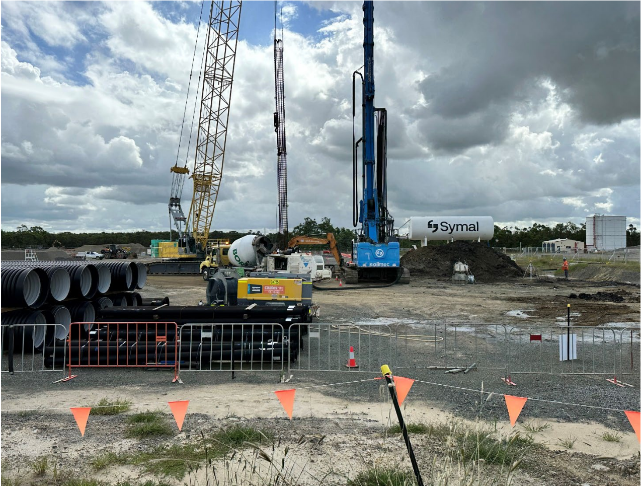
Photograph 1 – Piling Activities