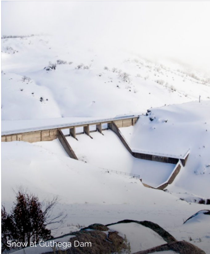
Snow at Guthega Dam

Click here - to help you answer the clues, take a look at the related fact sheet. You'll learn more about how Snowy Hydro harnesses the power of water within the water cycle to generate renewable electricity.