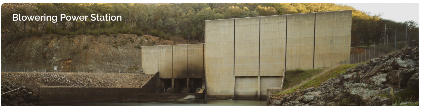
Blowering Power Station

Water releases from Blowering Dam are controlled by the NSW State Government to provide for downstream town water supply, irrigation and environmental uses.