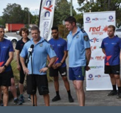
PCYC Fit for Work graduation ceremony in Tumut

nowy Hydro is a founding corporate partner of the Police Citizens Youth Clubs NSW (PCYC) and is committed to supporting the NSW Police Commissioner's RISEUP youth employment program, which provides employment pathways for disadvantaged and disengaged young people.