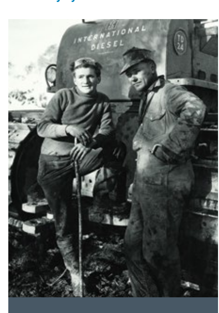
Tractor maintenance men at the Three Mile barracks near Kiandra, 1950

For information and to keep up-todate with activities, please register at snowyhydro.com.au