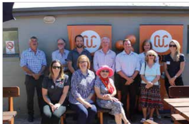
The families of the Snowy Hydro Family Program accepting our donation.

Snowy Hydro has long supported educational initiatives, from local school awards right through to the successful CUC, and we are proud to be associated with this successful community facility.