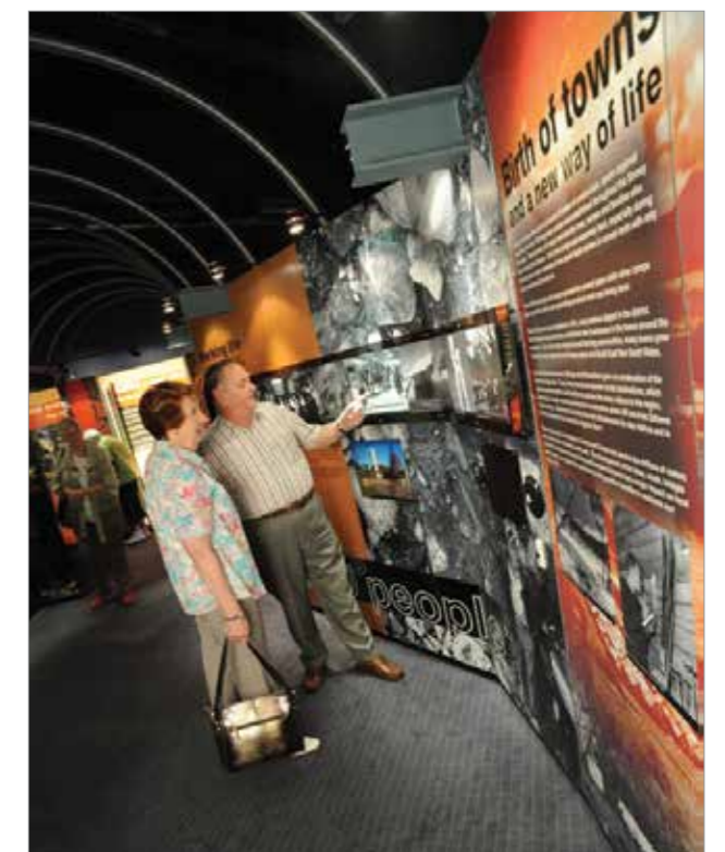
We have a number of displays showcasing the story of the Snowy Scheme.