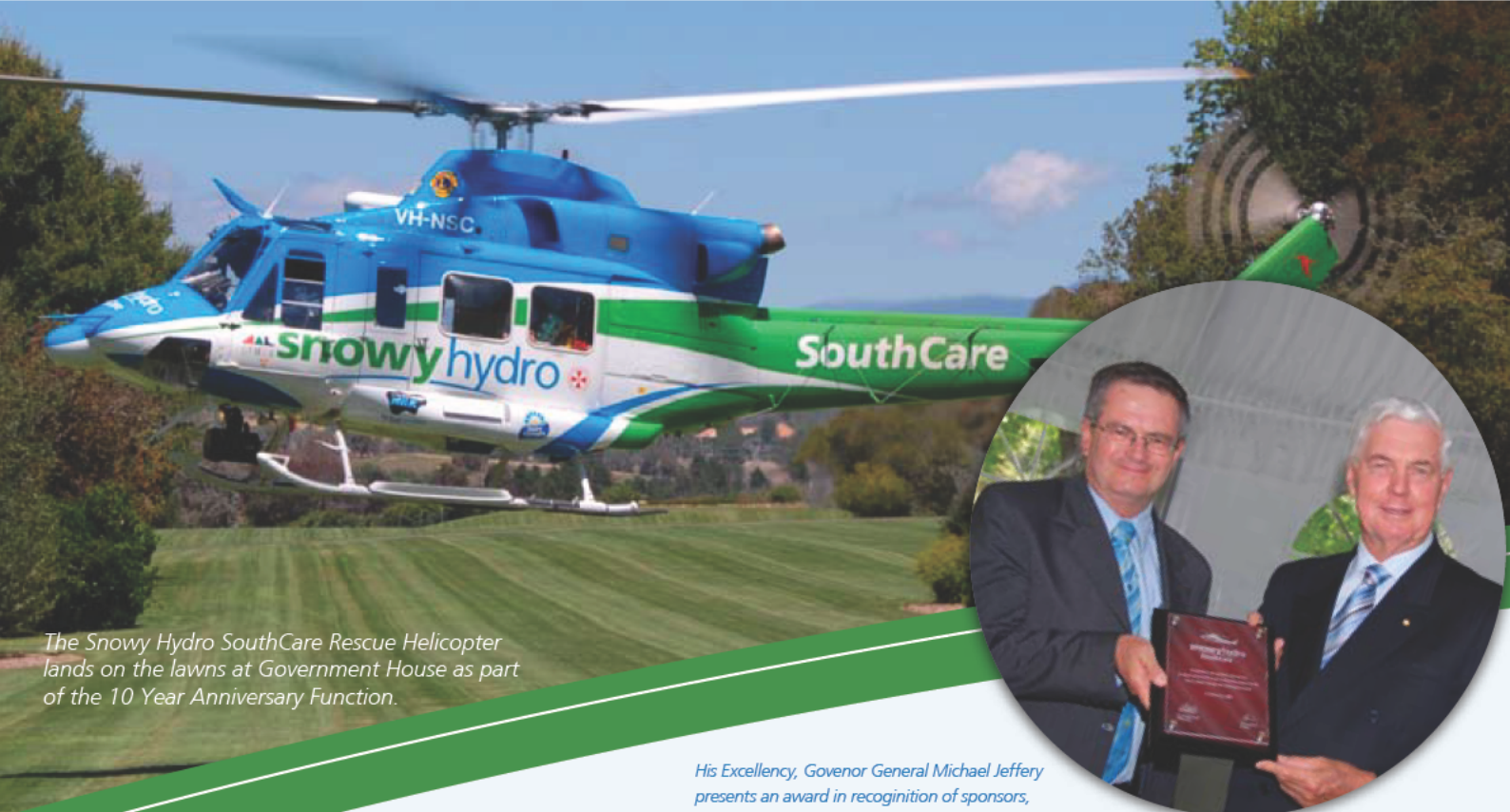
The Snowy Hydro SouthCare Rescue Helicopter lands on the lawns at Government House as part of the 10 Year Anniversary Function.