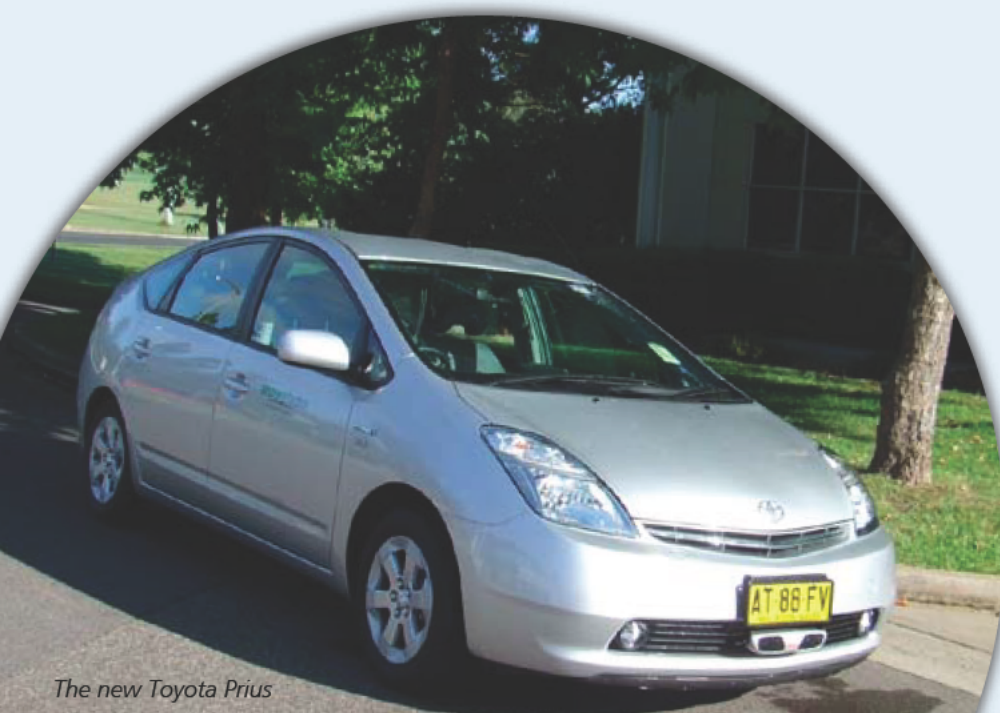
The new Toyota Prius

Additionally, all our carbon emissions from the rest of our fleet are offset through GreenFleet Australia. For more information on GreenFleet visit our website at www.snowyhydro.com.au