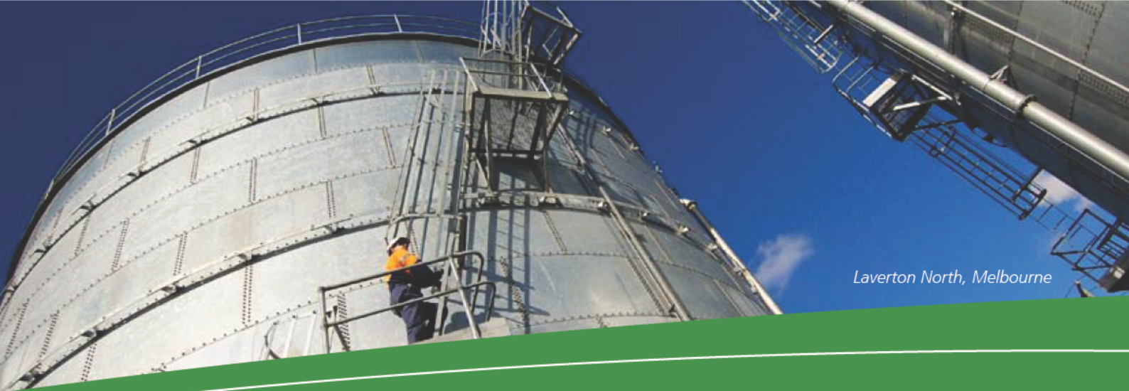
Laverton North, Melbourne