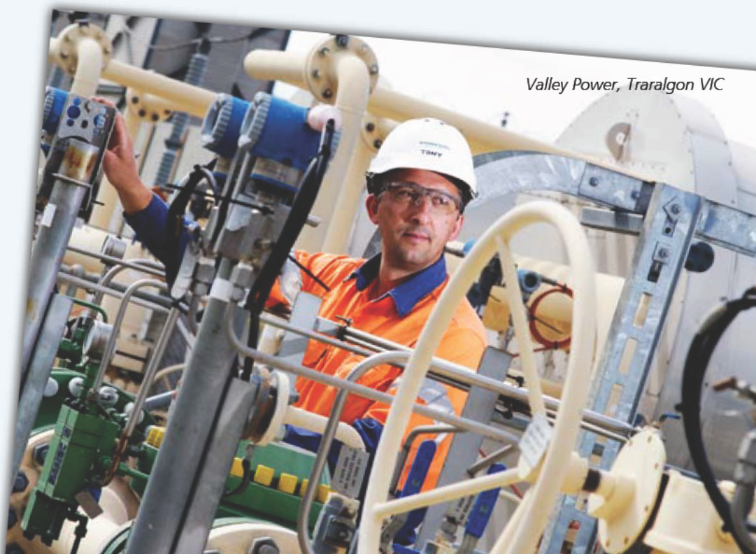
Valley Power, Traralgon VIC

If there is to be ongoing community discussion about our future, and I hope there is, I appeal for it to be a positive debate, to be accurately informed, and above all, to be forward looking.