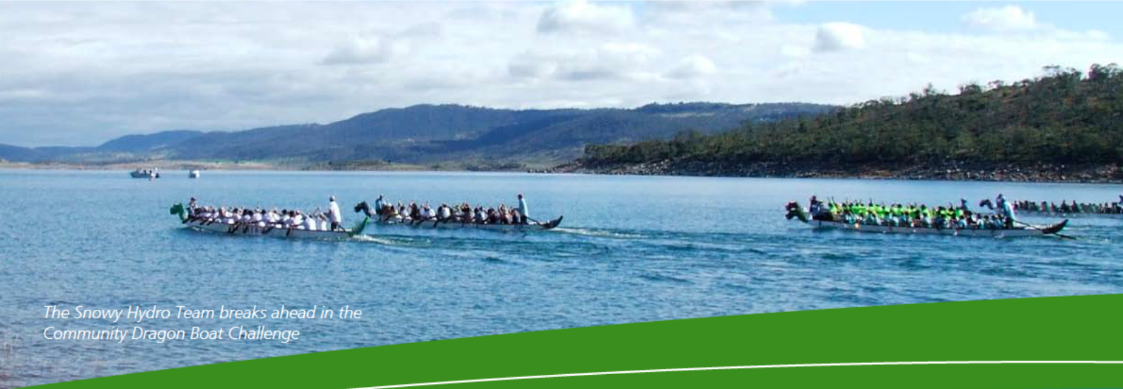
The Snowy Hydro Team breaks ahead in the Community Dragon Boat Challenge