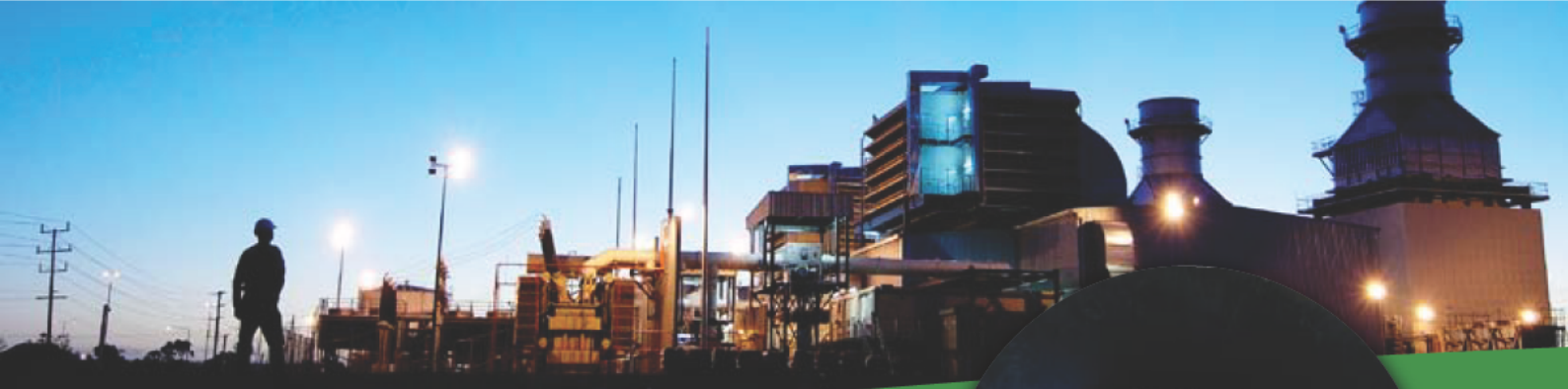
Laverton North Power Station, Melbourne VIC