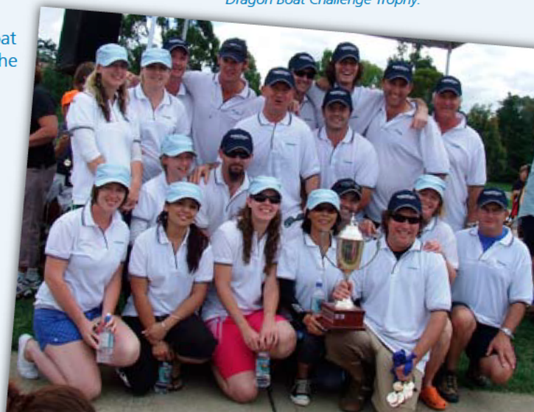
Below: Snowy Hydro Team 1 accepting the Lake Jindabyne Flowing Festival Community Dragon Boat Challenge Trophy.

We also look forward to competing again in 2009!