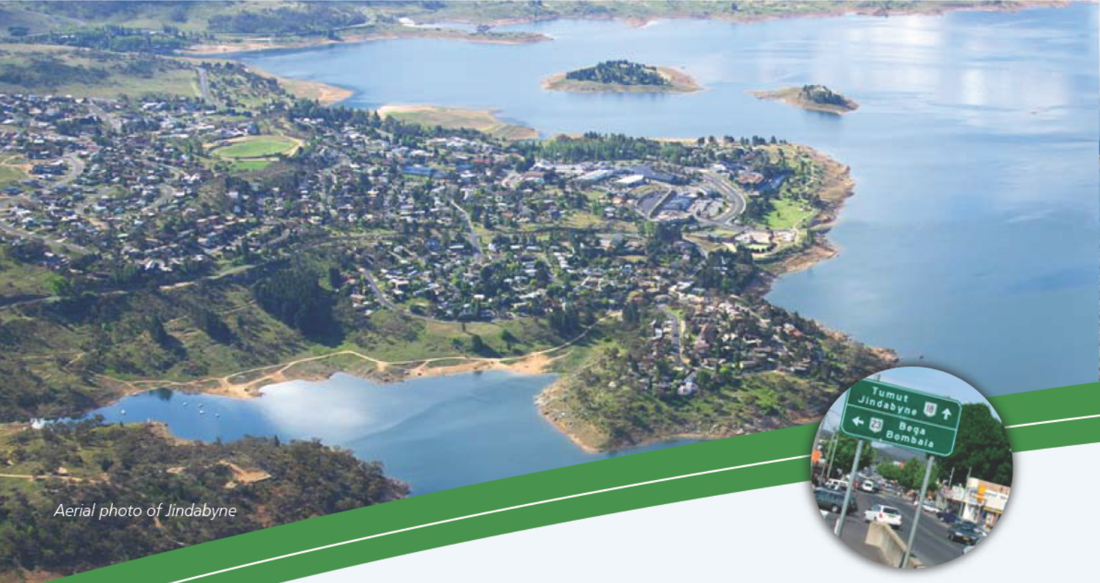
Aerial photo of Jindabyne