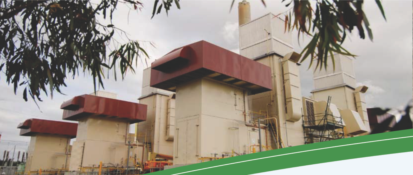
Valley Power, Traralgon VIC

Hopefully the Treasurer's blunt but correct comments will now serve as a wake-up call to all. We know our regional communities want a successful and growing Snowy Hydro Limited but it is not going to happen without access to additional capital, and soon.