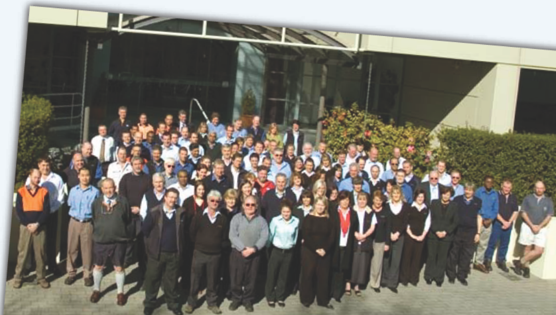
Snowy Hydro's Cooma employees