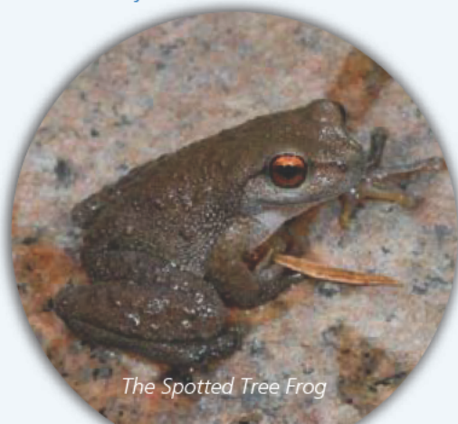
The Spotted Tree Frog

Spotted Tree Frogs became extinct in NSW in 1998 and are now listed as endangered both in NSW and nationally.