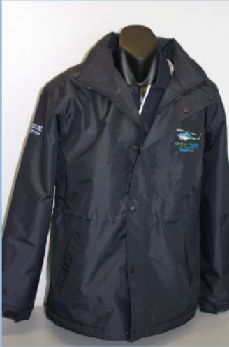
Stadium Jacket $110.00

Fleece-lined, wind-proof and water proof, these jackets are a must to keep warm and dry for all occasions. Features internal and external pockets, embroidery on each sleeve and the embroidered rescue helicopter logo on the front; the adults' stadium jackets are available in sizes from XS to 3XL.