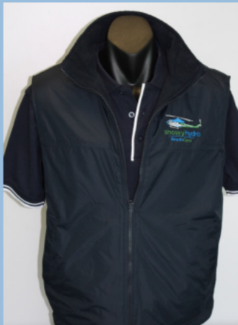
Reversible Vest $30

These jackets feature inside and outside pockets, warm fleece on the inside and windproof on the outside and the embroidered rescue helicopter on the front. The Inner Jacket is available in sizes from S to XXL.