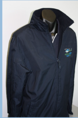
Inner Jacket $100.00

Fleece-lined, wind-proof and water proof, these jackets are a must to keep warm and dry for all occasions. Features internal and external pockets, embroidery on each sleeve and the embroidered rescue helicopter logo on the front; the adults' stadium jackets are available in sizes from XS to 3XL.