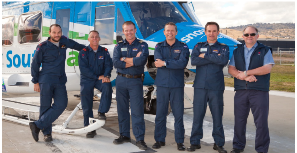
Aircrewmembers and Pilots from the Canadian Helicopter Company (CHC)