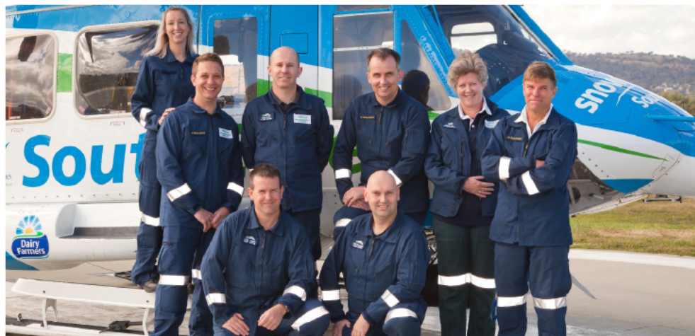
Doctors from the Capital Region Retrieval Service