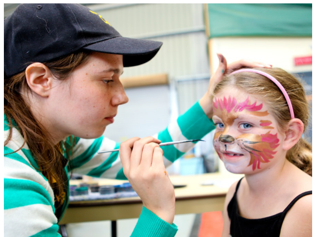
Children were treated to face painting (above), and purchased "Flash" the plush toy helicopter (top)