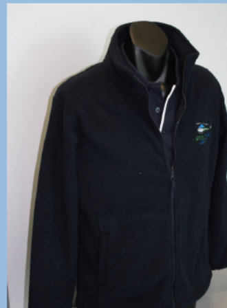
Zip up Fleece $55.00

These vests are fully reversible with the rescue helicopter embroidered. The vest features pockets on both sides and comes in sizes from S to XXL.