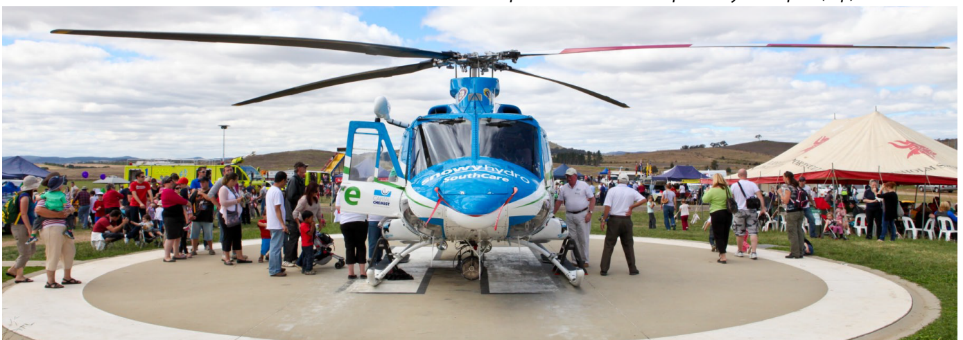
Families lined up to walk through and see the Snowy Hydro SouthCare Rescue Helicopter up close