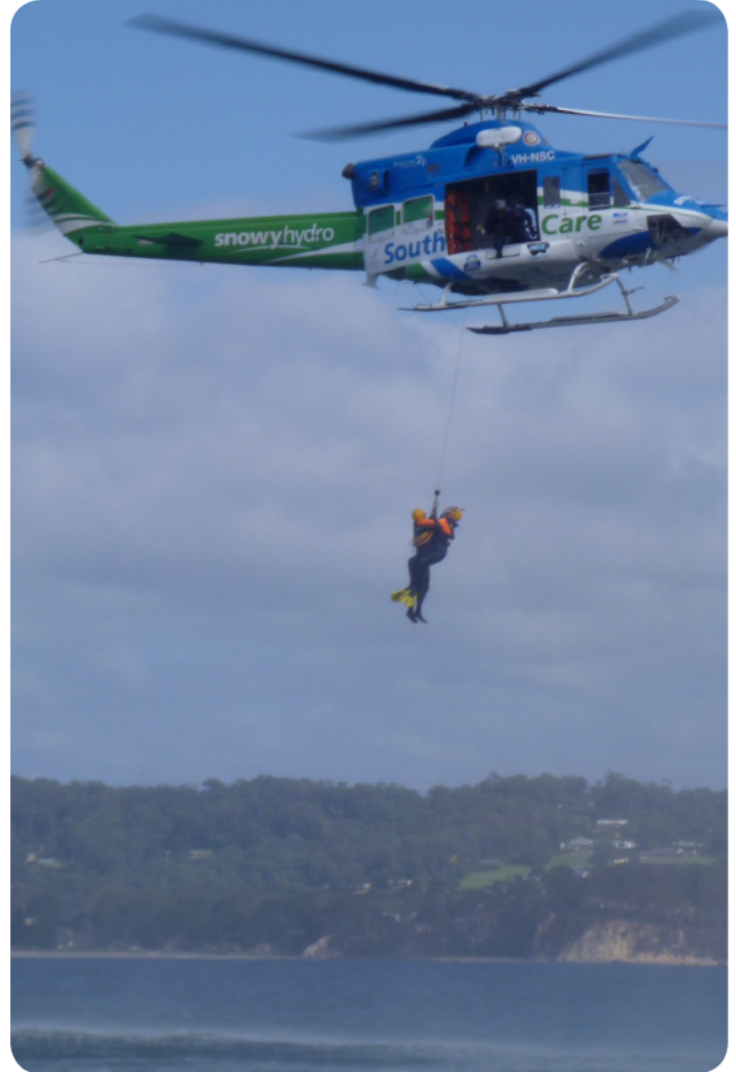
(L&R) Snowy Hydro SouthCare Crew practice their winching skills on the NSW South Coast in April 2011.

A magnificent life-saving tool, The Snowy Hydro SouthCare Rescue Helicopter is specially fitted with instruments that assist crew with retrieving patients. One of those instruments is the "Winch"