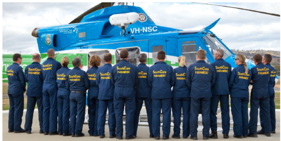
Intensive Care Paramedics from the ACT Ambulance Service