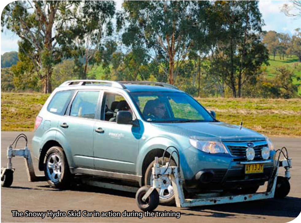
The Snowy Hydro Skid Car in action during the training

An update from our major and naming-rights sponsor