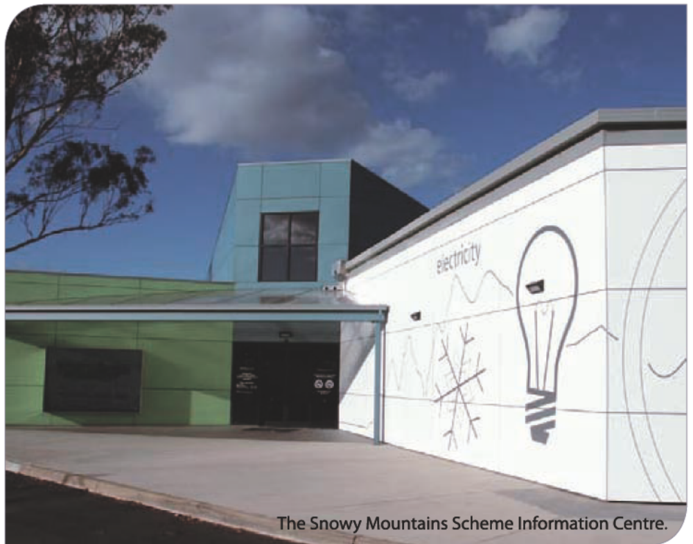
The Snowy Mountains Scheme Information Centre.