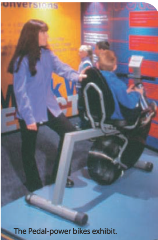
The Pedal-power bikes exhibit.

An update from our major and naming-rights sponsor