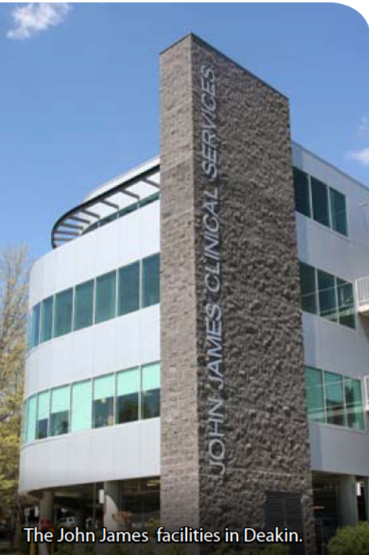
The John James facilities in Deakin.

The John James Memorial Foundation donates $50,000 to the Service